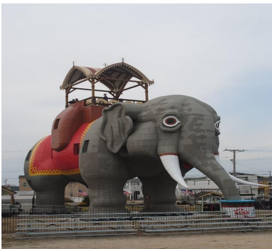
Lucy, the Elephant